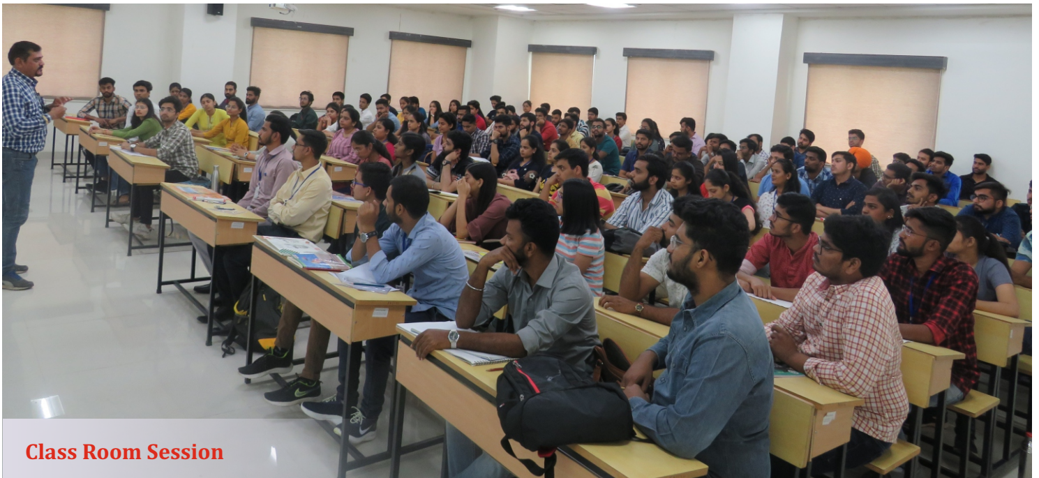
Class Room Session